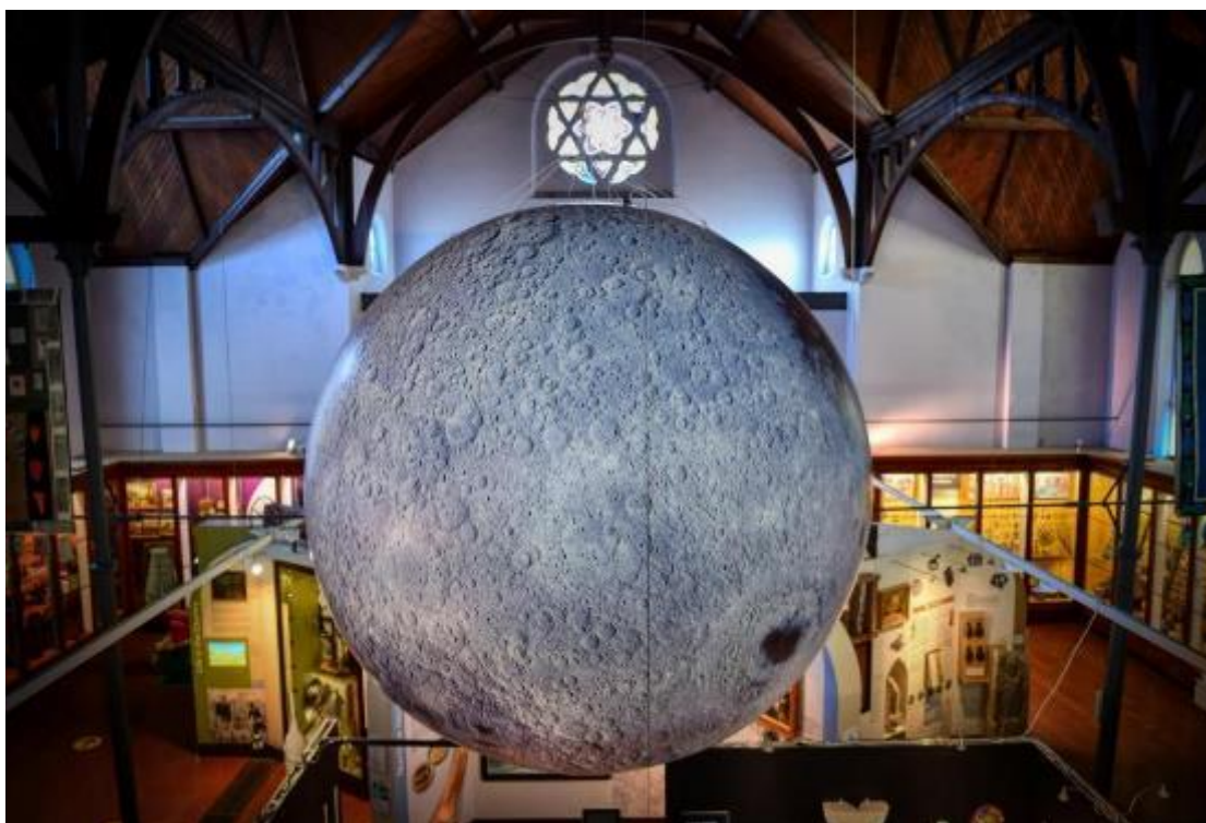
Model of the Moon at Lynn Museum.