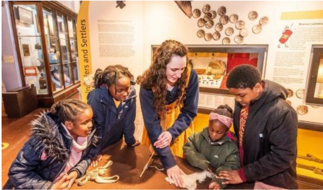
Event at Lynn Museum.