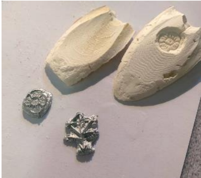
Carved cuttlefish moulds and pewter badges from the workshop at Lynn Museum