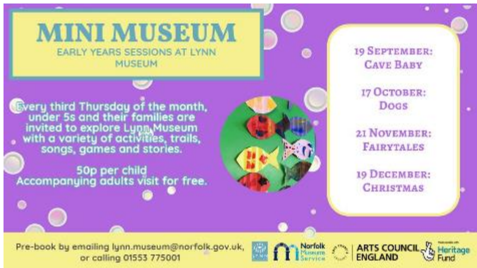
Publicity poster for minimuseum at Lynn Museum for autumn 2024.